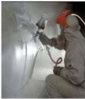
Figure 1 Now you see it