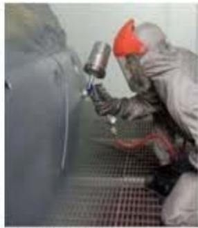
Figure 2 Now you don't